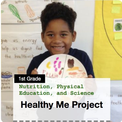
1st Grade Nutrition, Physical Education, and Science Healthy Me Project