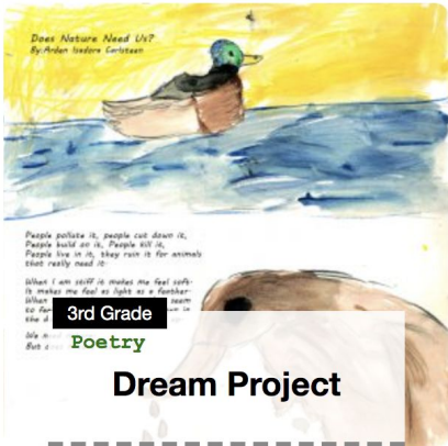
3rd Grade Poetry Dream Project