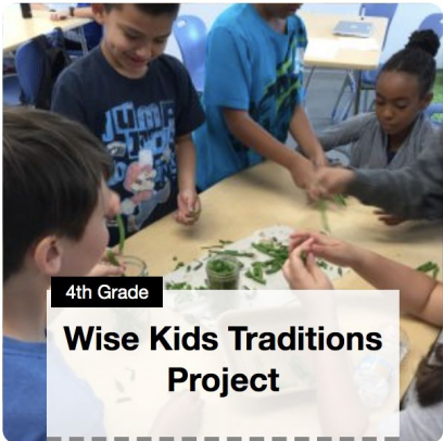
4th Grade Wise Kids Traditions Project